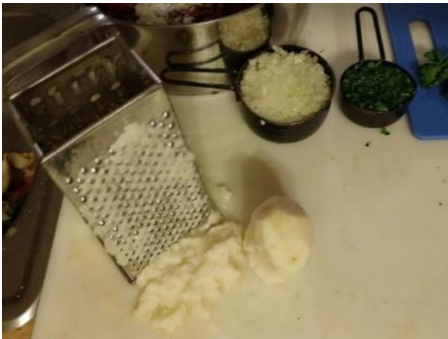
Grated Potato, Chopped Onion & Parsley.

NOTE: It's okay to err on the conservative side of spice at first – simply mix and fry a “sample” meatball to taste. You can always add more spice, but you can't easily take it away! For the banquet, I scaled everything up for 6 lbs. of venison.