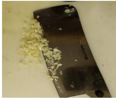
Mincing the Garlic.