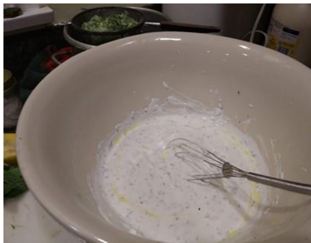
Melding the yogurt, garlic, oil, lemon, and spices.

Serve chilled with pita bread for dipping.