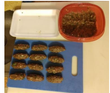
Rolled and Ready!