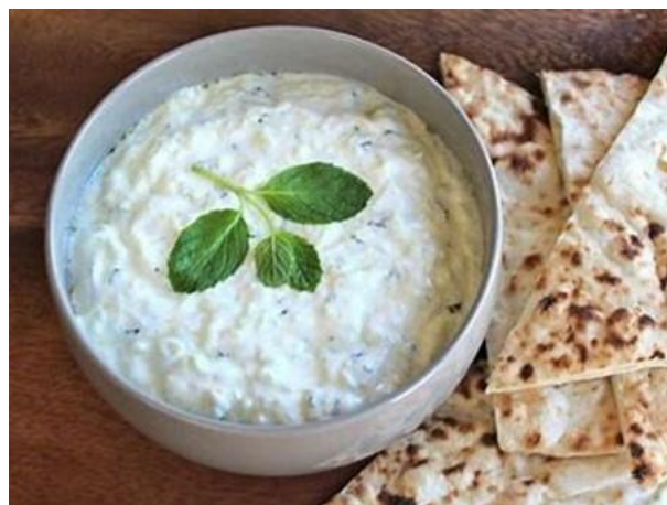
Tzatziki with a Mint Garnish and Pita Bread.

Tzatziki is a popular appetizer, or “Meze” that combines simple ingredients and appeals to the most discriminating palate!