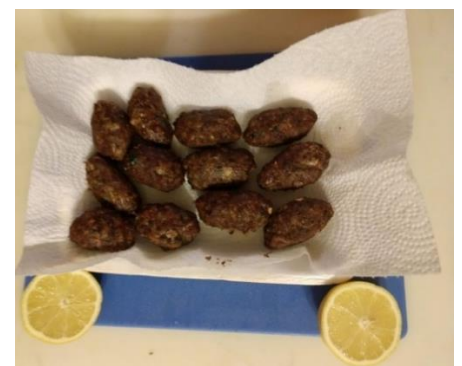
Fresh from the Fryer & Ready to Plate!