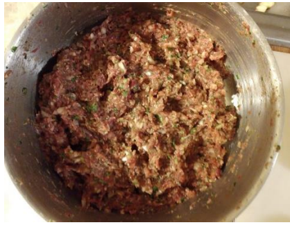
Well-blended Mixture “Ready to Roll”