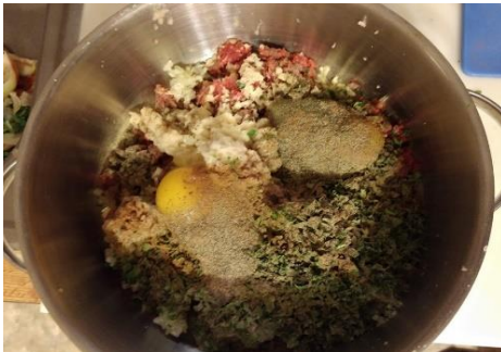
All Ingredients Ready to Mix.