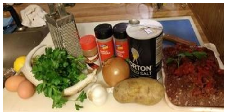
Basic Ingredients from the Farm Fridge!

Oil for frying (peanut, canola, vegetable, etc.)