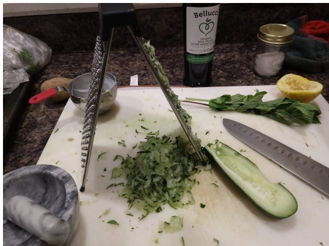
Grating the Cucumber.