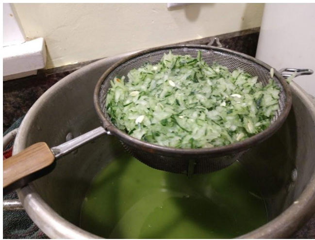
Draining Grated Cucumber.