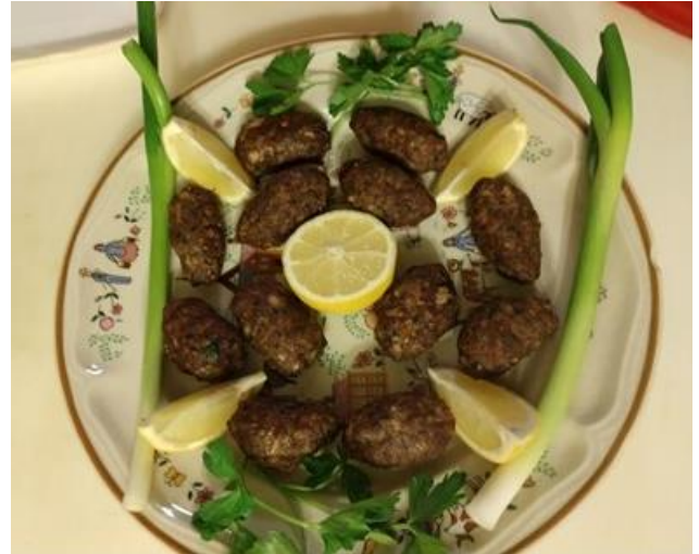
Feature Picture: Venison Keftedes with Spring Onion

I made the batch featured in this article at our farm in Southampton County using ground venison from the freezer which was harvested on the property during the early 2018 archery season. We turn some pretty good food out of our modest kitchen at the hunting camp, and it is particularly satisfying to know the star ingredient comes from our land!