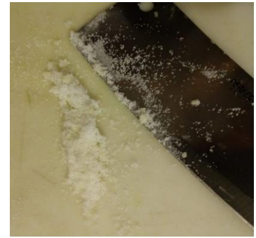
Salting the Board!