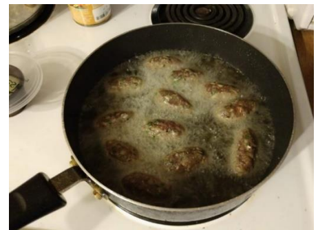
Frying Keftedes in a Skillet.